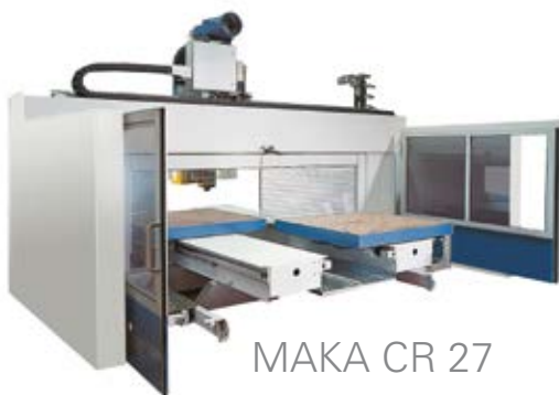
MAKA CR 27

The extensive product portfolio includes other machines with a similar requirements profile in addition to the PM Modular. The CR 27 and SM 20 table machines are worth considering as an industry solution in the panel/ furniture segment. The PM 270 moving gantry machine is suitable for machining particularly large widths. Your respective MAKA sales partner will be happy to advise you.