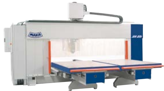
MAKA SM 20

Our sales partners can be found at www.maka.com