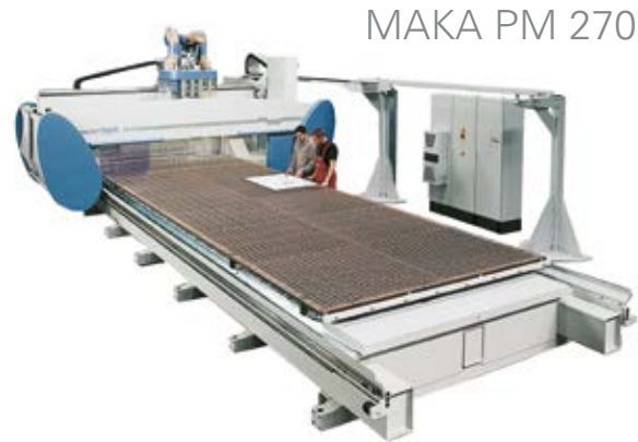
MAKA PM 270