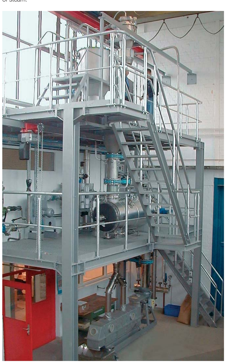
Hydrothermal cooking plant in the SCHULE pilot plant at Reinbek