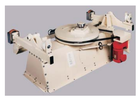
Support base with drive