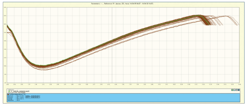
Batch overlapping of process values

Selection of batches by date or batch no.